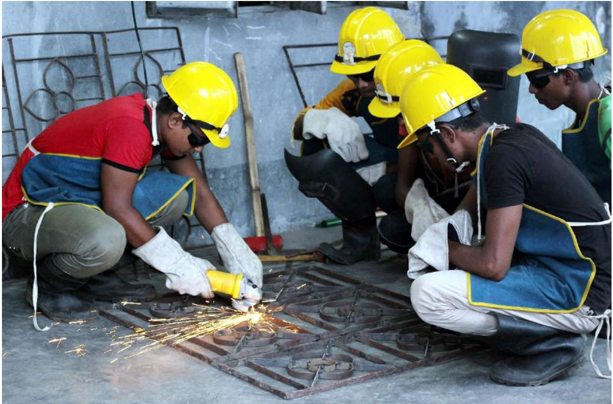
Youths are receiving technical training from UttaranChuknagar Technical Training Centre