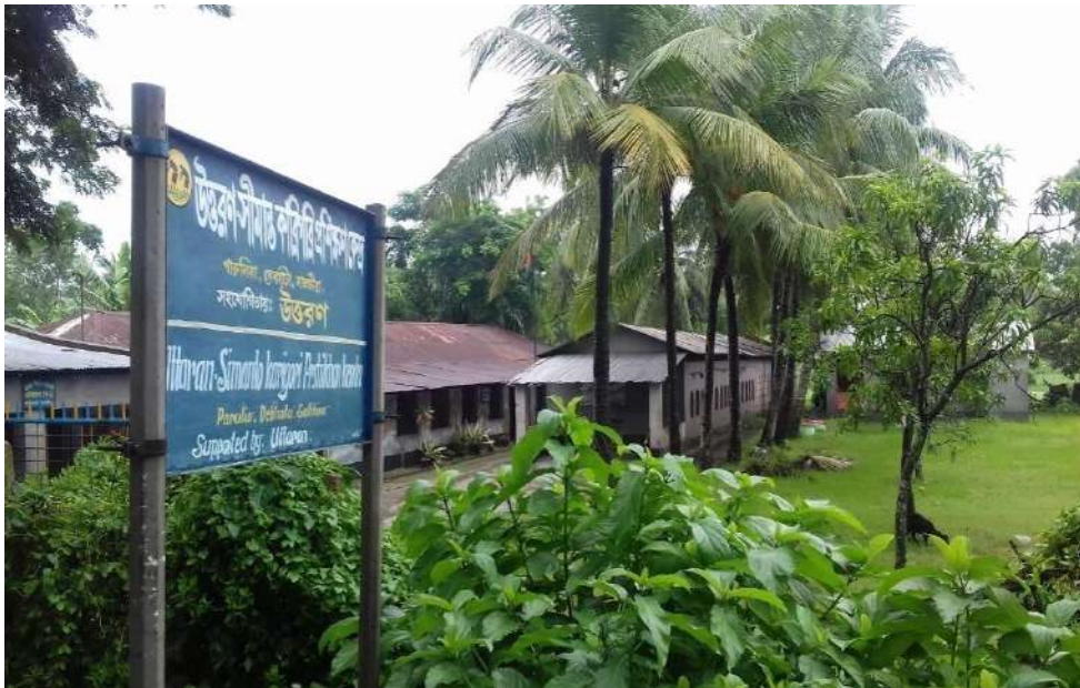
UttaranShemanto Technical Training Centre, Debhata, Satkhira