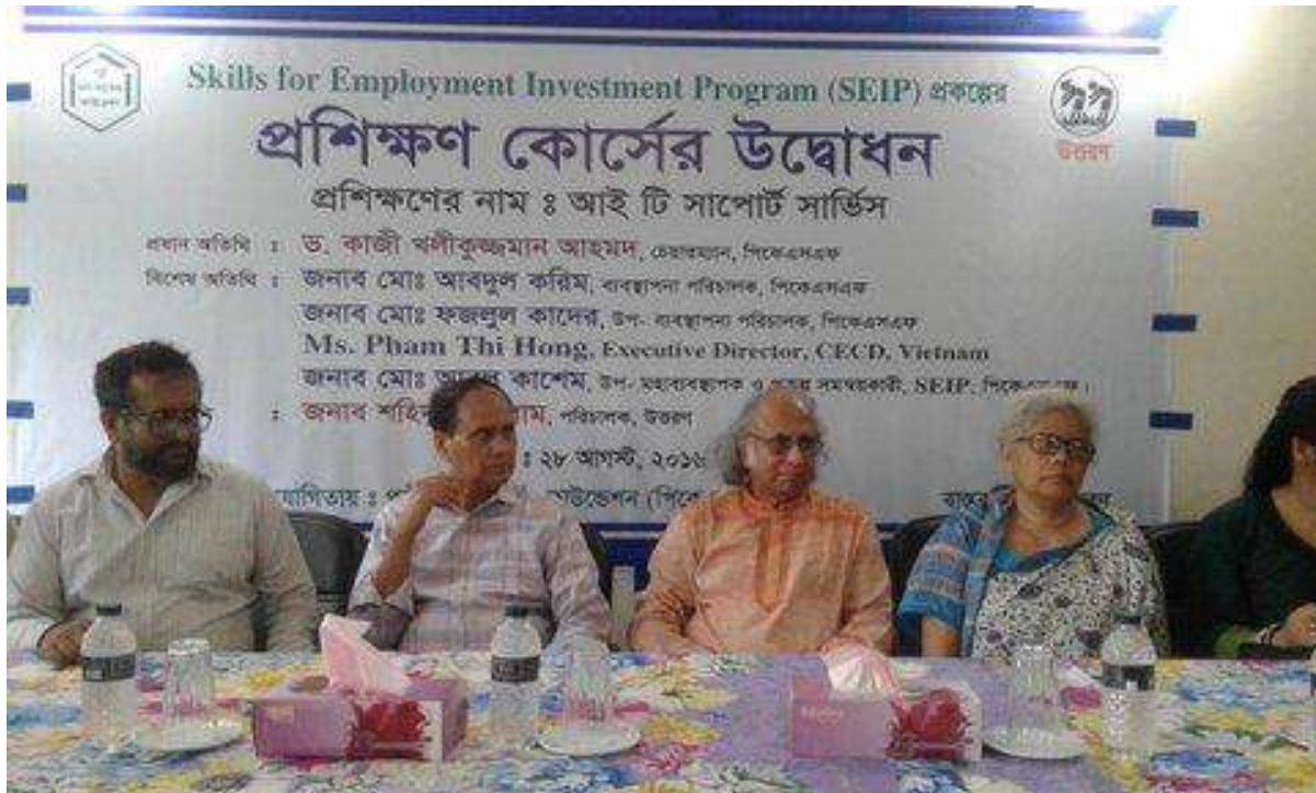
Inauguration ceremony of SEIP project