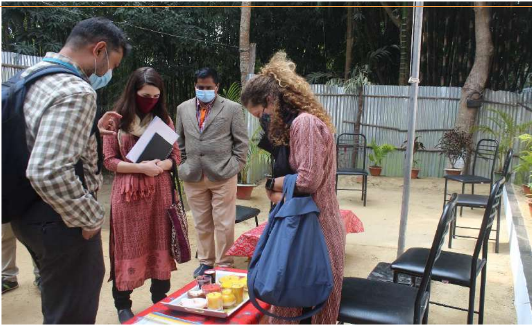
Representatives from Global Affairs Canada and UNDP Bangladesh visited Uttaran's skills programme at Ukhyia