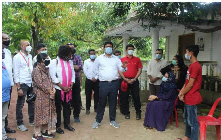
Project Director of ROSC Phase II, World Bank and Sae the Children's representatives visited Uttaran's skills programme