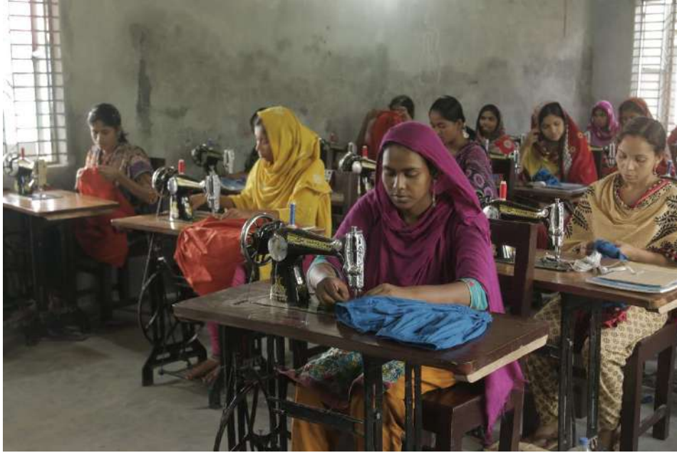
Youths are receiving technical training from UttaranChuknagar Technical Training Centre